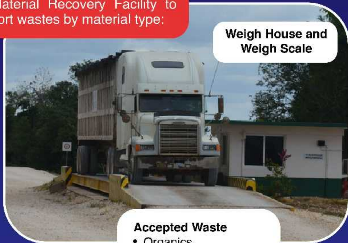
Weigh House and Weigh Scale

Trucks entering the facility are weighed and diverted to the Material Recovery Facility to sort wastes by material type: